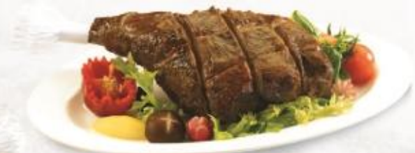
Leg of Lamb RM188