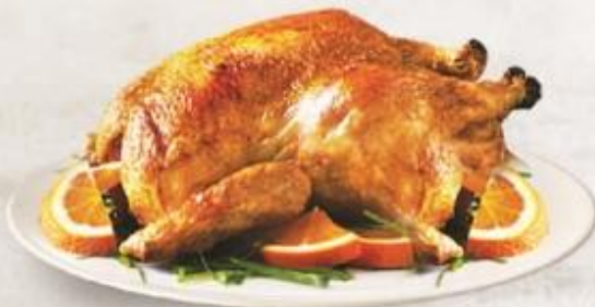
Rotisserie Chicken RM98