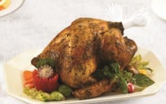
Black Pepper Turkey RM208