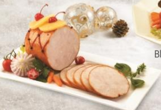
Chicken Meatloaf RM188